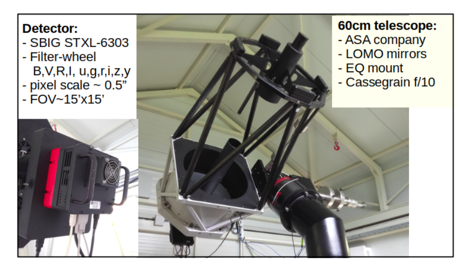
Figure 2: The 60cm telescope.

is equipped with the FLI PL230 back-illuminated CCD camera<sup>12</sup> of Finger Lakes Instrumentation, and a filter-wheel with Johnson-Cousin B, V, R, I and SDSS u, g, r, i, z, y filters. As far as observations are concerned, photometric observations in the mentioned filters are mainly done on this telescope.